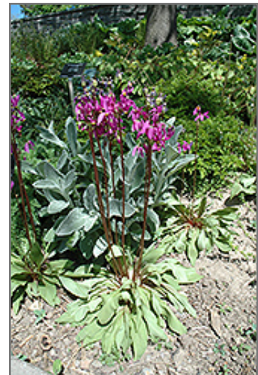
Aphrodite Shooting Star in bloom