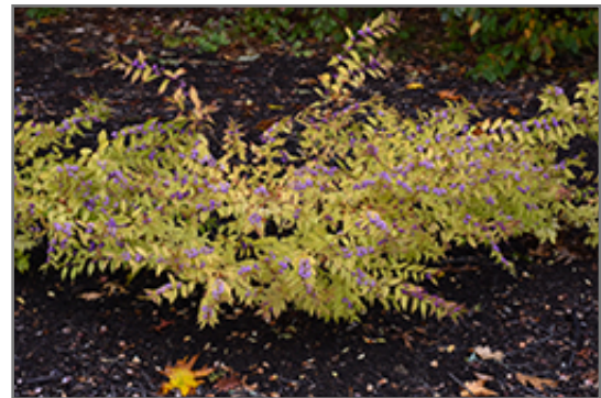
Early Amethyst Beautyberry fruit