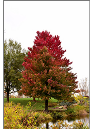
Red Sunset Red Maple in fall