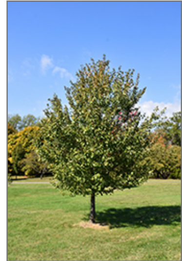
Red Sunset Red Maple

This tree should only be grown in full sunlight. It is quite adaptable, preferring to grow in average to wet conditions, and will even tolerate some standing water. It is not particular as to soil type, but has a definite preference for acidic soils, and is subject to chlorosis (yellowing) of the foliage in alkaline soils. It is somewhat tolerant of urban pollution. This is a selection of a native North American species.