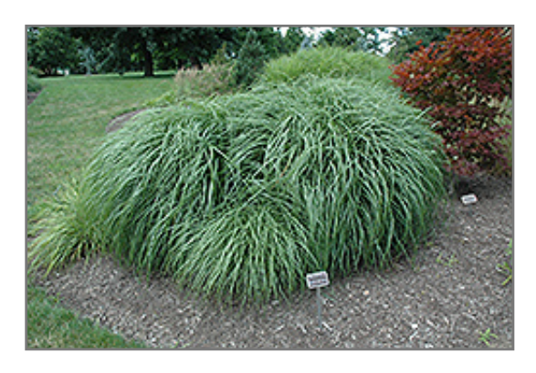
Adagio Maiden Grass foliage

401 Torbay Road St. Johns, NL A1C 5C9 (709)726-1283 (877)726-1283