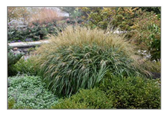
Adagio Maiden Grass flowers