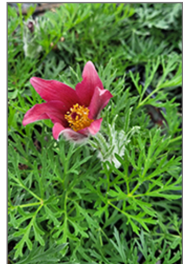
Red Pasqueflower flowers