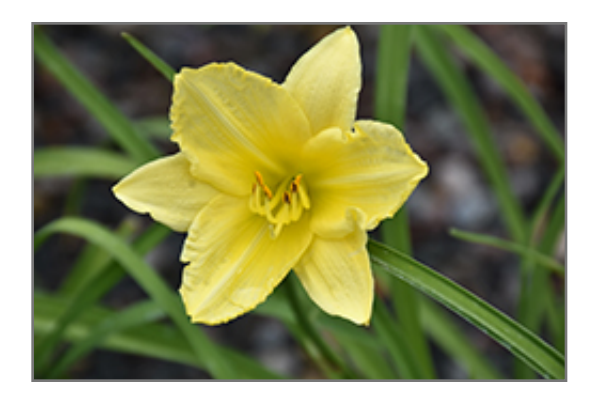
Happy Ever Appster Big Time Happy Daylily flowers

401 Torbay Road St. Johns, NL A1C 5C9 (709)726-1283 (877)726-1283