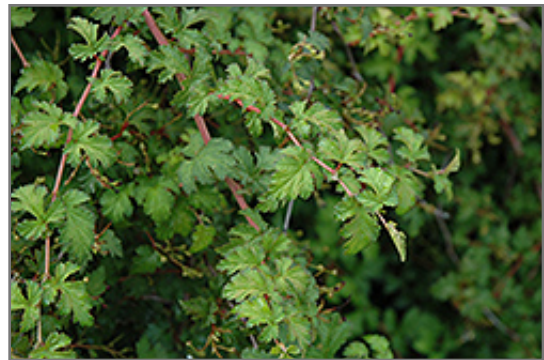
Cutleaf Stephanandra foliage