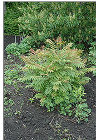
Sem False Spirea