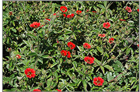
Gibson's Scarlet Cinquefoil flowers