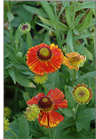
Sahin's Early Flowerer Sneezeweed flowers

This plant will require occasional maintenance and upkeep, and should be cut back in late fall in preparation for winter. It is a good choice for attracting butterflies to your yard, but is not particularly attractive to deer who tend to leave it alone in favor of tastier treats. Gardeners should be aware of the following characteristic(s) that may warrant special consideration;