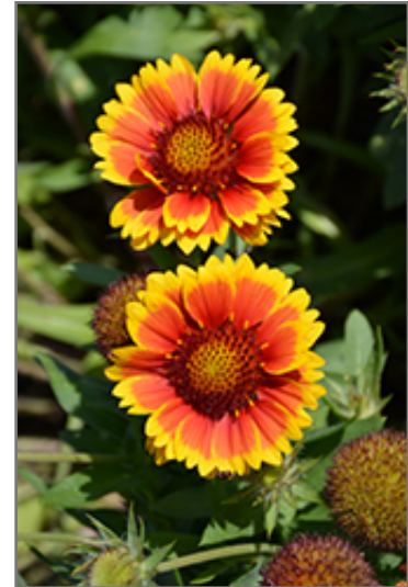
Arizona Sun Blanket Flower flowers

Arizona Sun Blanket Flower is recommended for the following landscape applications;