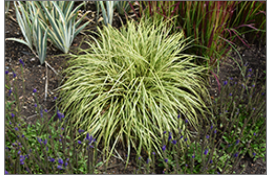
Evergold Variegated Japanese Sedge foliage

Evergold Variegated Japanese Sedge will grow to be about 8 inches tall at maturity, with a spread of 12 inches. Its foliage tends to remain low and dense right to the ground. It grows at a medium rate, and under ideal conditions can be expected to live for approximately 10 years. As an evergreen perennial, this plant will typically keep its form and foliage year-round.