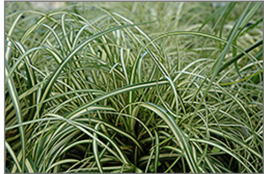
Evergold Variegated Japanese Sedge foliage

Evergold Variegated Japanese Sedge is recommended for the following landscape applications;