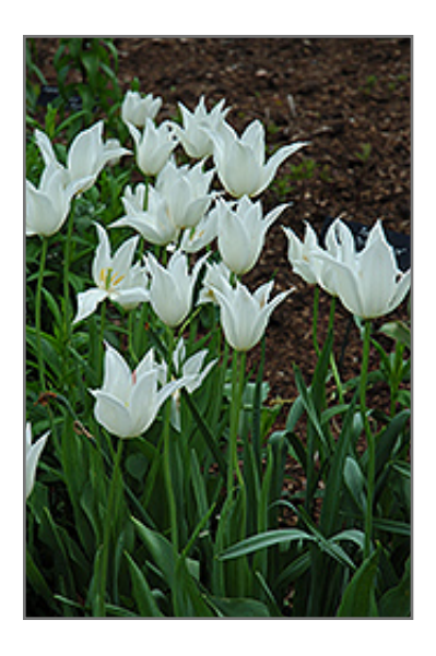
White Triumphator Tulip flowers

White Triumphator Tulip will grow to be about 20 inches tall at maturity, with a spread of 12 inches. When grown in masses or used as a bedding plant, individual plants should be spaced approximately 6 inches apart. The flower stalks can be weak and so it may require staking in exposed sites or excessively rich soils. It grows at a medium rate, and under ideal conditions can be expected to live for approximately 10 years. As an herbaceous perennial, this plant will usually die back to the crown each winter, and will regrow from the base each spring. Be careful not to disturb the crown in late winter when it may not be readily seen! As this plant tends to go dormant in summer, it is best interplanted with late-season bloomers to hide the dying foliage.