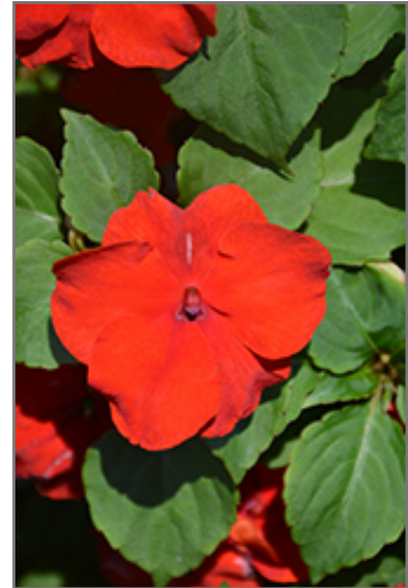
Xtreme Red Impatiens flowers

Xtreme Red Impatiens is recommended for the following landscape applications;