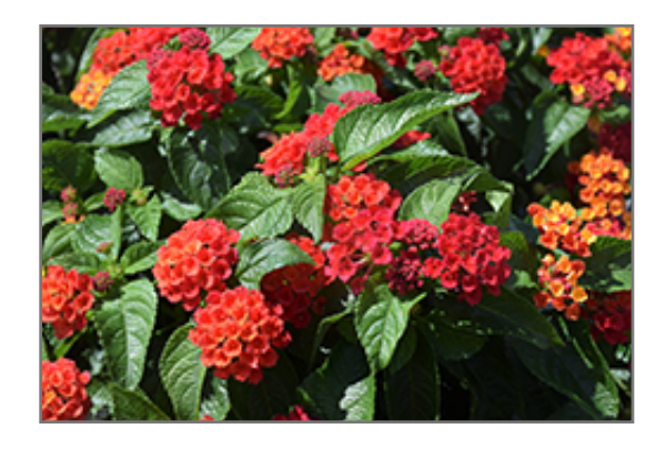
Bloomify Red Lantana flowers

401 Torbay Road St. Johns, NL A1C 5C9 (709)726-1283 (877)726-1283