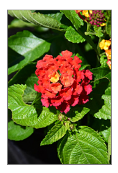
Bloomify Red Lantana flowers