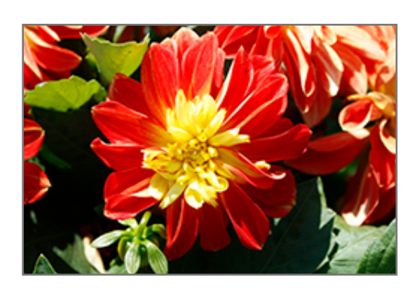
Dalaya Fireball Dahlia flowers

Stunning orange and yellow bi-colored blooms sit on top of well branched, dark green foliage; early to flower and slow to fade, this variety performs well in gardens and containers; stunning as cut flower arrangements; attracts birds and butterflies