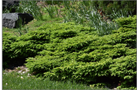
Little Gem Spruce

This shrub does best in full sun to partial shade. It does best in average to evenly moist conditions, but will not tolerate standing water. It is not particular as to soil type or pH, and is able to handle environmental salt. It is highly tolerant of urban pollution and will even thrive in inner city environments. This is a selected variety of a species not originally from North America.