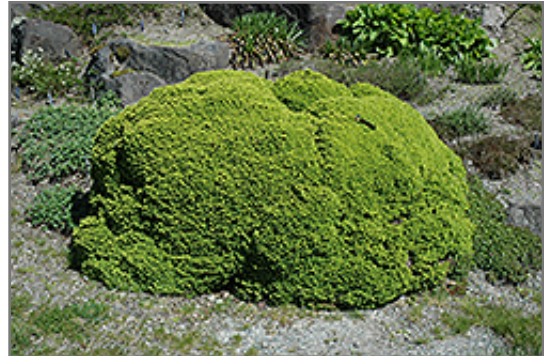
Little Gem Spruce