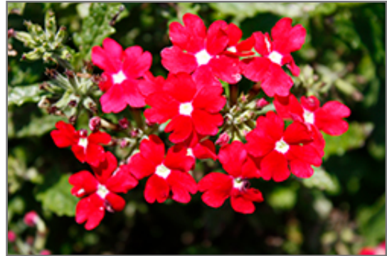
Cadet Upright Red Verbena flowers

Cadet Upright Red Verbena is recommended for the following landscape applications;