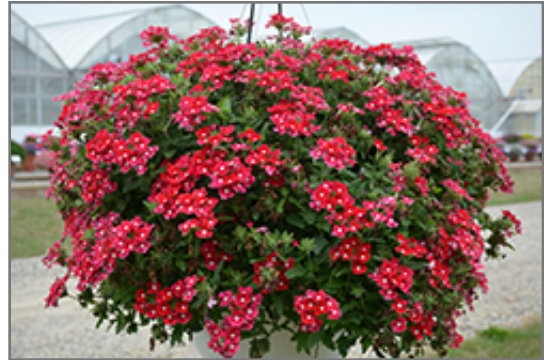
Cadet Upright Red Verbena in bloom

Cadet Upright Red Verbena will grow to be about 10 inches tall at maturity, with a spread of 14 inches. When grown in masses or used as a bedding plant, individual plants should be spaced approximately 10 inches apart. Its foliage tends to remain low and dense right to the ground. This fast-growing annual will normally live for one full growing season, needing replacement the following year.