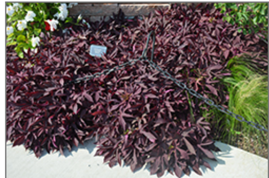
Sweet Caroline Red Hawk Sweet Potato Vine