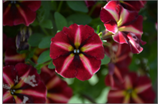
ColorRush Merlot Star Petunia flowers

ColorRush Merlot Star Petunia is a fine choice for the garden, but it is also a good selection for planting in outdoor containers and hanging baskets. It is often used as a 'filler' in the 'spiller-thriller-filler' container combination, providing a mass of flowers against which the thriller plants stand out. Note that when growing plants in outdoor containers and baskets, they may require more frequent waterings than they would in the yard or garden.