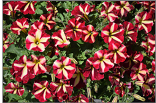
ColorRush Merlot Star Petunia flowers

ColorRush Merlot Star Petunia is recommended for the following landscape applications;