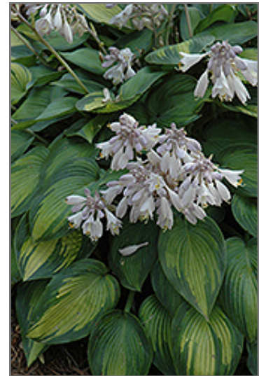
June Hosta flowers