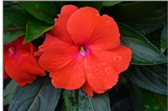
Magnum Red Flame New Guinea Impatiens flowers