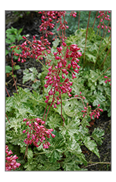
Snow Angel Coral Bells flowers

Snow Angel Coral Bells is recommended for the following landscape applications;