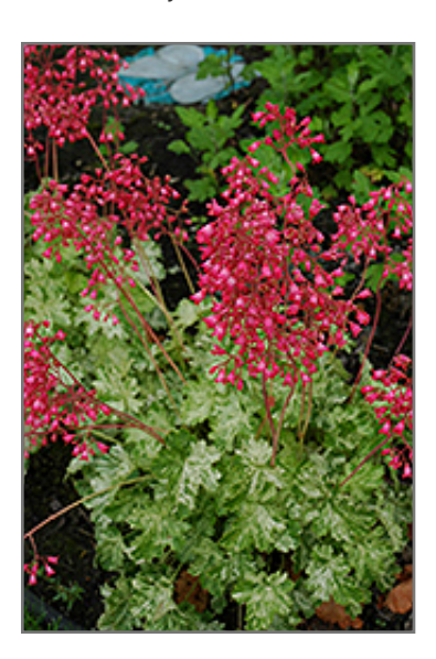
Snow Angel Coral Bells in bloom