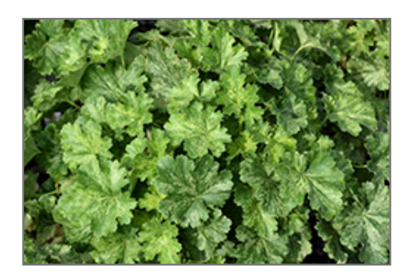
Snow Angel Coral Bells

Snow Angel Coral Bells will grow to be about 8 inches tall at maturity extending to 18 inches tall with the flowers, with a spread of 12 inches. When grown in masses or used as a bedding plant, individual plants should be spaced approximately 10 inches apart. Its foliage tends to remain low and dense right to the ground. It grows at a medium rate, and under ideal conditions can be expected to live for approximately 10 years. As an evegreen perennial, this plant will typically keep its form and foliage year-round.