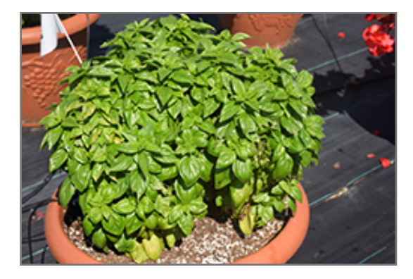
Dolce Fresca Basil

Dolce Fresca Basil is a good choice for the edible garden, but it is also well-suited for use in outdoor pots and containers. It is often used as a 'filler' in the 'spiller-thriller-filler' container combination, providing a mass of flowers and foliage against which the thriller plants stand out. Note that when growing plants in outdoor containers and baskets, they may require more frequent waterings than they would in the yard or garden.