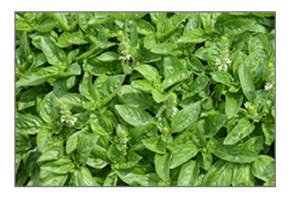
Dolce Fresca Basil foliage

Dolce Fresca Basil will grow to be about 14 inches tall at maturity, with a spread of 14 inches. When grown in masses or used as a bedding plant, individual plants should be spaced approximately 12 inches apart. This fast-growing annual will normally live for one full growing season, needing replacement the following year.