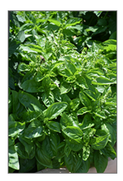
Dolce Fresca Basil