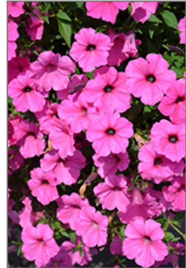
ColorRush Pink Petunia flowers

ColorRush Pink Petunia is recommended for the following landscape applications;