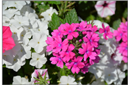
Superbena Pink Shades Verbena flowers

Superbena Pink Shades Verbena is recommended for the following landscape applications;