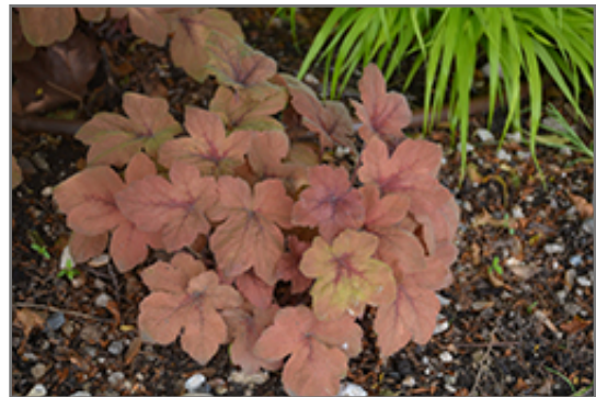
Pumpkin Spice Foamy Bells