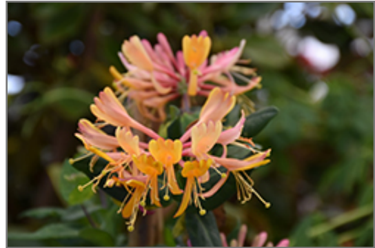
Goldflame Honeysuckle flowers