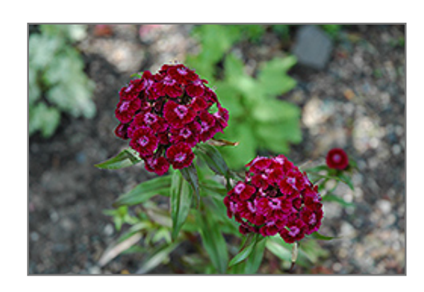
Sweet William flowers

Tall stems with densely packed crimson colored, frilly flowers with white eyes rise above narrow green foliage during the late spring and into the fall; excellent addition to cottage gardens, beds, borders or containers