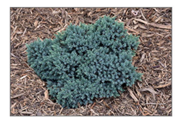
Blue Star Juniper