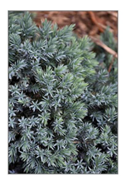
Blue Star Juniper foliage