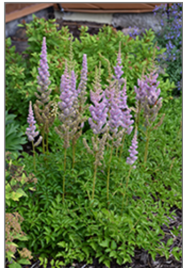
Dwarf Chinese Astilbe in bloom