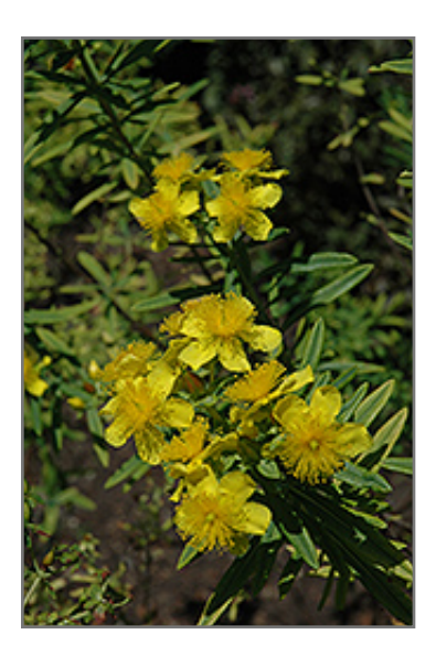
Kalm's St. John's Wort flowers