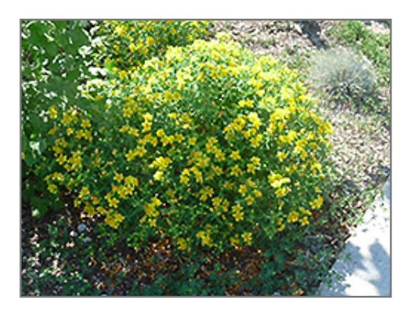
Kalm's St. John's Wort in bloom