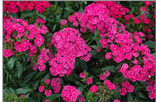
Jolt Pink Hybrid Pinks flowers

Jolt Pink Hybrid Pinks is recommended for the following landscape applications;