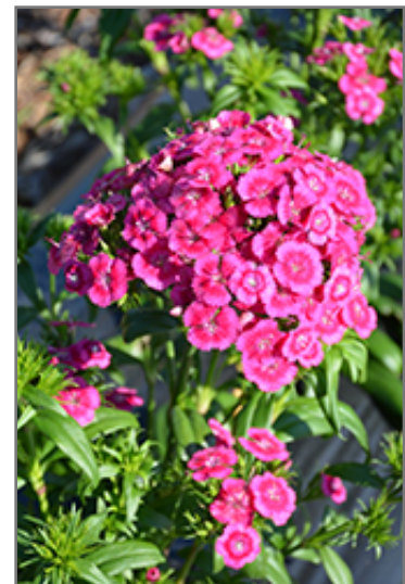
Jolt Pink Hybrid Pinks flowers