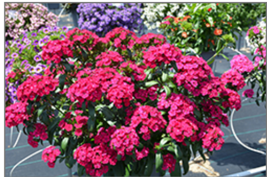
Jolt Cherry Hybrid Pinks in bloom