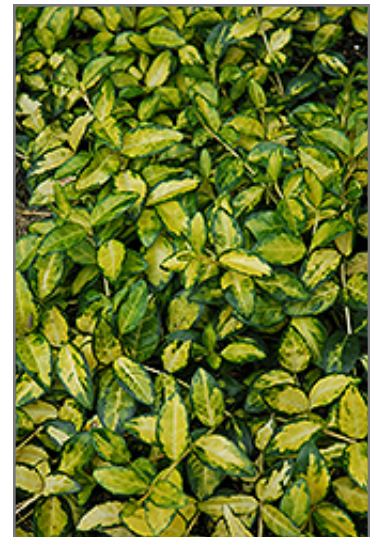
Illumination Periwinkle foliage