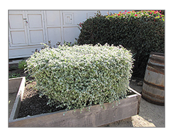
Licorice Plant