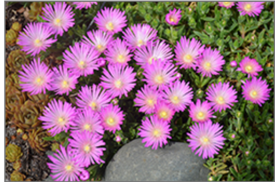
Table Mountain Ice Plant flowers

Table Mountain Ice Plant is recommended for the following landscape applications;