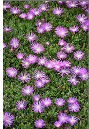
Table Mountain Ice Plant flowers

Table Mountain Ice Plant is a fine choice for the garden, but it is also a good selection for planting in outdoor pots and containers. Because of its spreading habit of growth, it is ideally suited for use as a 'spiller' in the 'spiller-thriller-filler' container combination; plant it near the edges where it can spill gracefully over the pot. Note that when growing plants in outdoor containers and baskets, they may require more frequent waterings than they would in the yard or garden. Be aware that in our climate, most plants cannot be expected to survive the winter if left in containers outdoors, and this plant is no exception. Contact our experts for more information on how to protect it over the winter months.