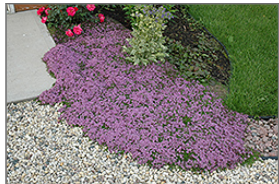
Red Creeping Thyme in bloom