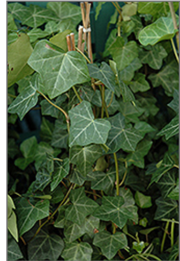
Thorndale Ivy foliage