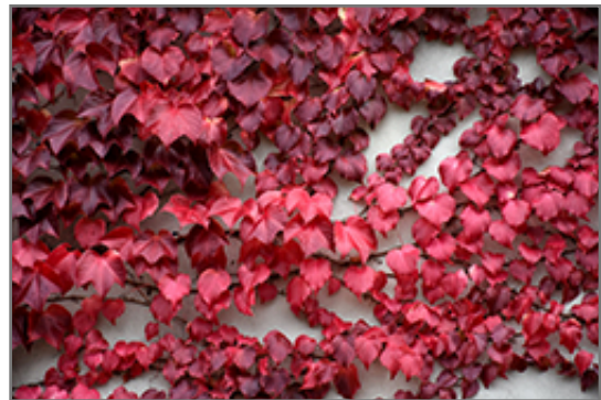
Veitch Boston Ivy in fall