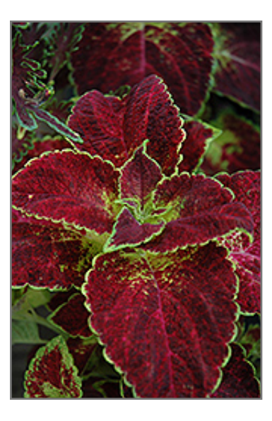
ColorBlaze Dipt in Wine Coleus foliage