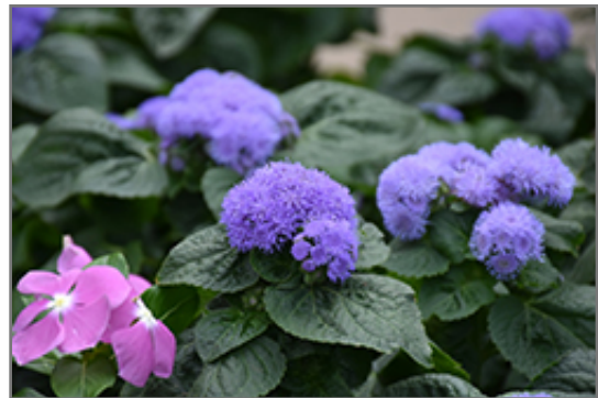
High Tide Blue Flossflower flowers