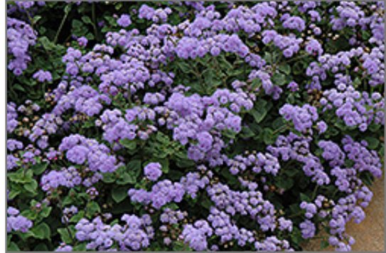
High Tide Blue Flossflower in bloom

High Tide Blue Flossflower is a fine choice for the garden, but it is also a good selection for planting in outdoor containers and hanging baskets. It is often used as a 'filler' in the 'spiller-thriller-filler' container combination, providing a mass of flowers against which the thriller plants stand out. Note that when growing plants in outdoor containers and baskets, they may require more frequent waterings than they would in the yard or garden.