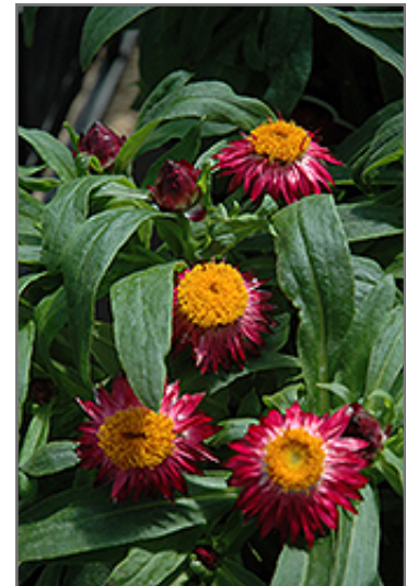
Mohave Dark Red Strawflower flowers