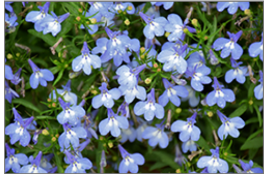
Techno Upright Light Blue Lobelia flowers

Techno Upright Light Blue Lobelia is recommended for the following landscape applications;