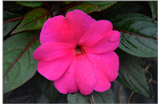
Magnum Blue New Guinea Impatiens flowers

Magnum Blue New Guinea Impatiens is recommended for the following landscape applications;