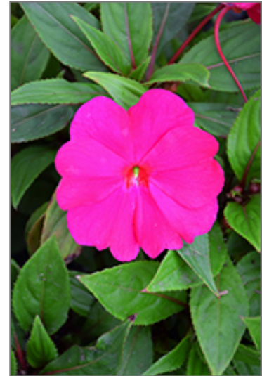
Divine Violet New Guinea Impatiens flowers

Divine Violet New Guinea Impatiens is recommended for the following landscape applications;