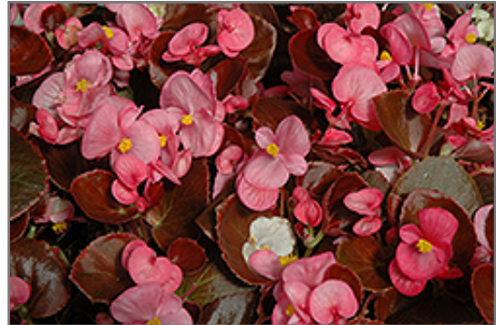
Nightife Rose Begonia flowers

Nightife Rose Begonia is recommended for the following landscape applications;