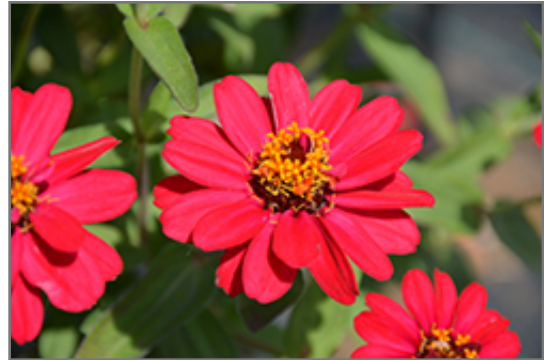
Profusion Double Hot Cherry Zinnia flowers