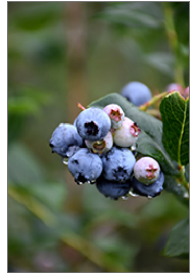
Chippewa Blueberry fruit

Chippewa Blueberry features dainty clusters of white bell-shaped flowers with shell pink overtones hanging below the branches in mid spring. It has green deciduous foliage. The glossy oval leaves turn an outstanding orange in the fall. It features an abundance of magnificent blue berries in mid summer.