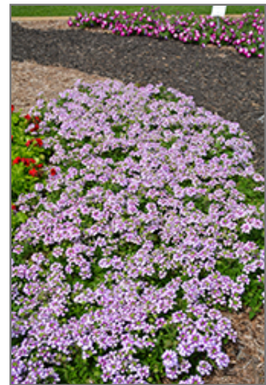
Lanai Twister Purple Verbena in bloom